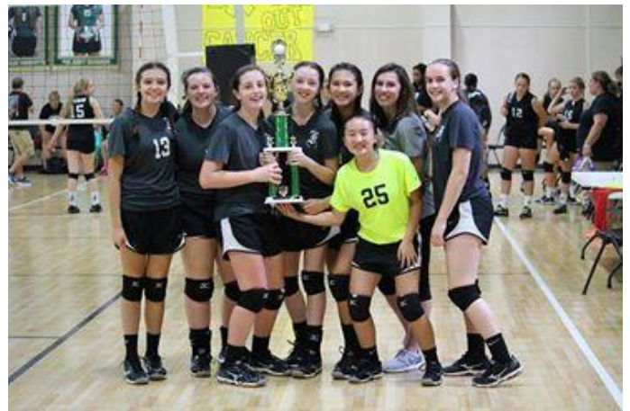
Junior High A Team